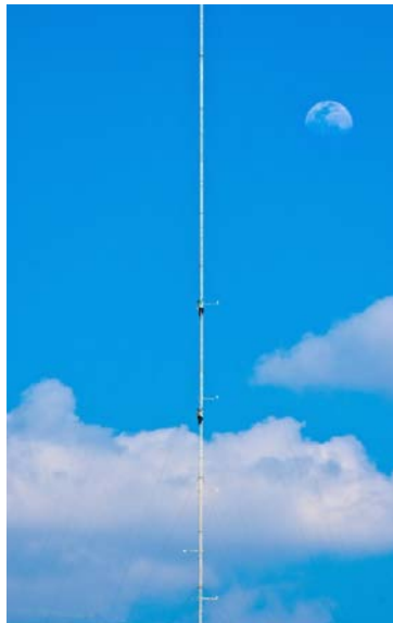
Figure 1: Picture of climbers inspecting a meteorological mast. WAsP combines measurements and advanced flow models to provide reliable resource assessments.

Due to the exclusion of non-linear effects, the flow model in WAsP and other linear models require terrains with gentle slopes of less than